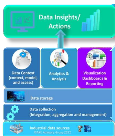
Operational Historian Components

suppliers are also using advanced analytics for newer capabilities and enhancements like auto features that include auto-connect or recognize, auto-updates, auto maintenance, auto data management and auto model updates that are leading to a more autonomous future