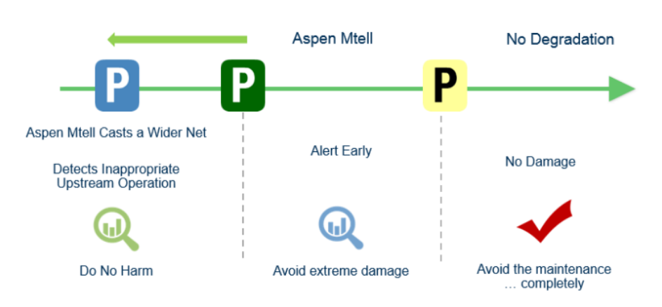
Catch Operational Errors and Avoid Unneeded Maintenance

While statistical techniques, engineered equations, or other model-based prediction approaches can sometimes detect impending asset failure, they do not provide as much forewarning of asset degradation and failure. Producing such methods is intensely difficult and the models can contain inaccuracies, deliver many false positives, and are extremely constrained. The methods also cannot capture the biggest root causes – upstream process